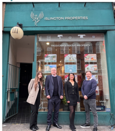
Staff from left to right:

Contact us to book your free valuation at 020 7871 4444 or info@islingtonproperties.com . www.islingtonproperties.com Follow us on Instagram @islingtonproperties.com.